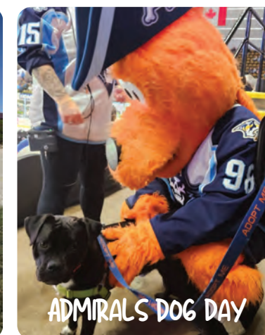
ADMIRALS DOG DAY