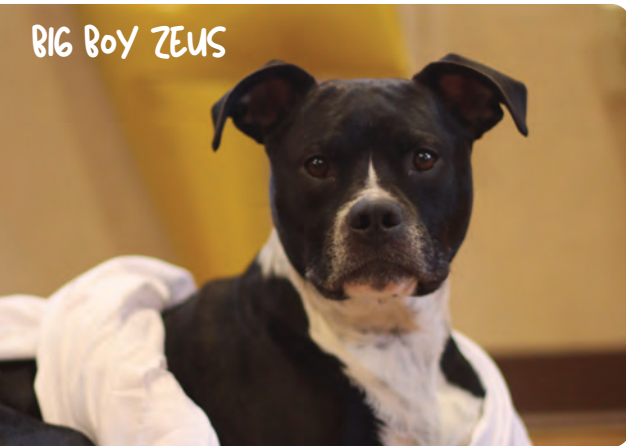
BIG BOY ZEUS