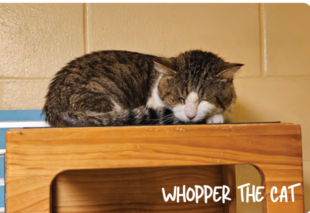
WHOPPER THE CAT