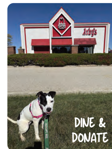
DINE & DONATE

Combining people and pets in activities means everyone wins!