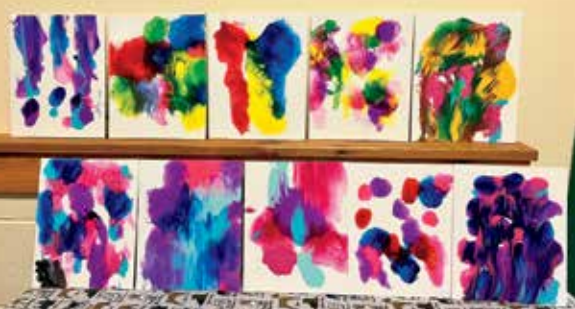
The K9 Portrait Gallery.