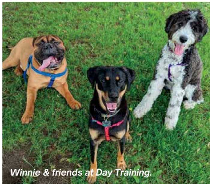
Winnie & friends at Day Training.