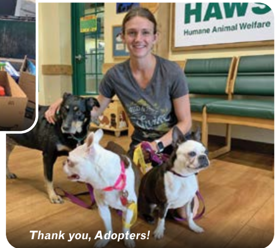
Thank you, Adopters!

Through our many adjustments, a few things have stood out to us at HAWS: