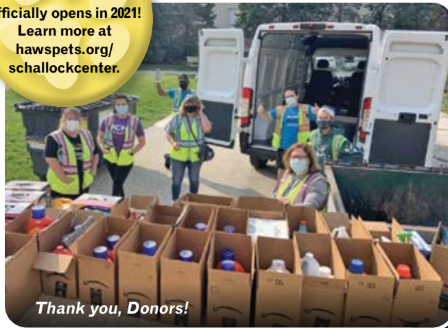
Thank you, Donors!

HAWS Schallock Center for Animals officially opens in 2021! Learn more at hawspets.org/schallockcenter .